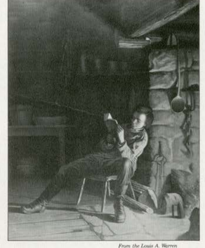
FIGURE 1. Young Abraham Lincoln.

Think, instead, of the political chaos provided by such a view. What happens to the Mexican War, the territorial acquisitions from which provided the focus of the political issues that led to war? Stephen Douglas would be alive for the whole war, to lead the loyal opposition, but he